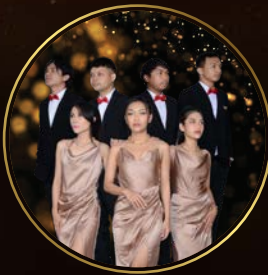
International Party Band ARENBEE BAND 7:00 PM - 10:00 PM